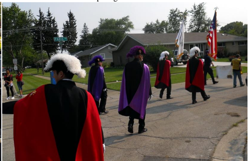
And Away We Go!