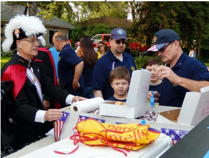
Checking out the Donuts