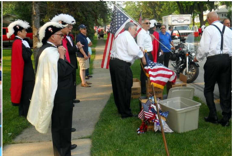
Preparing to March