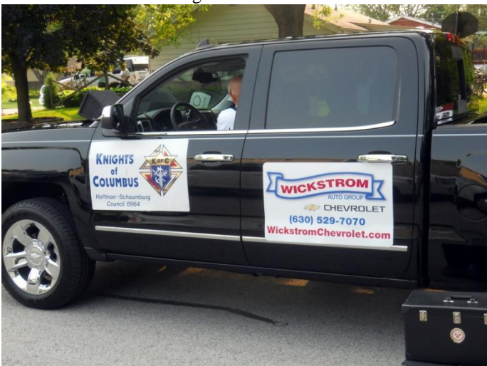
The truck carrying our supplies